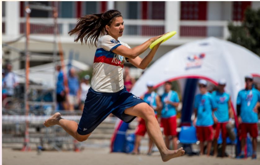
Female athlete from Team Russia catching a disc.