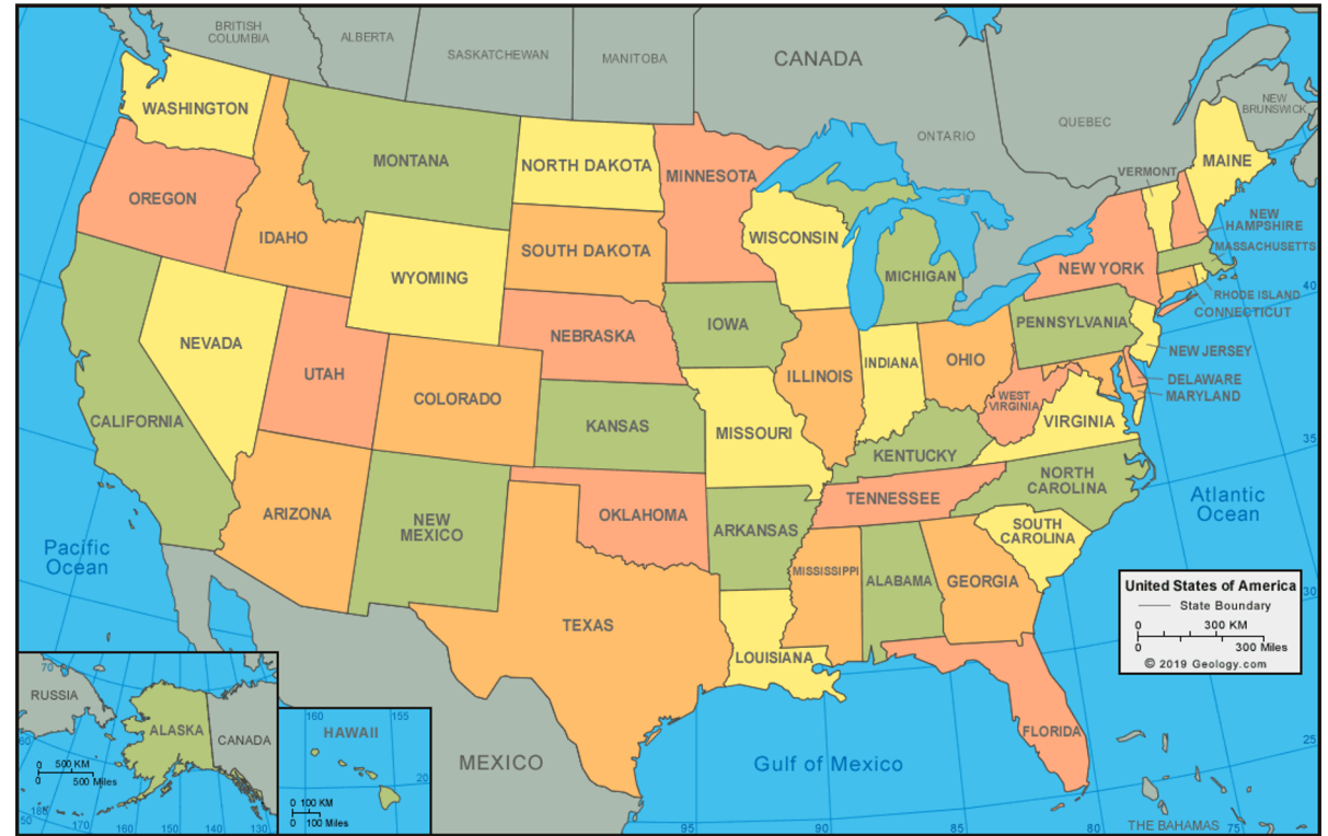
Map of the United States.