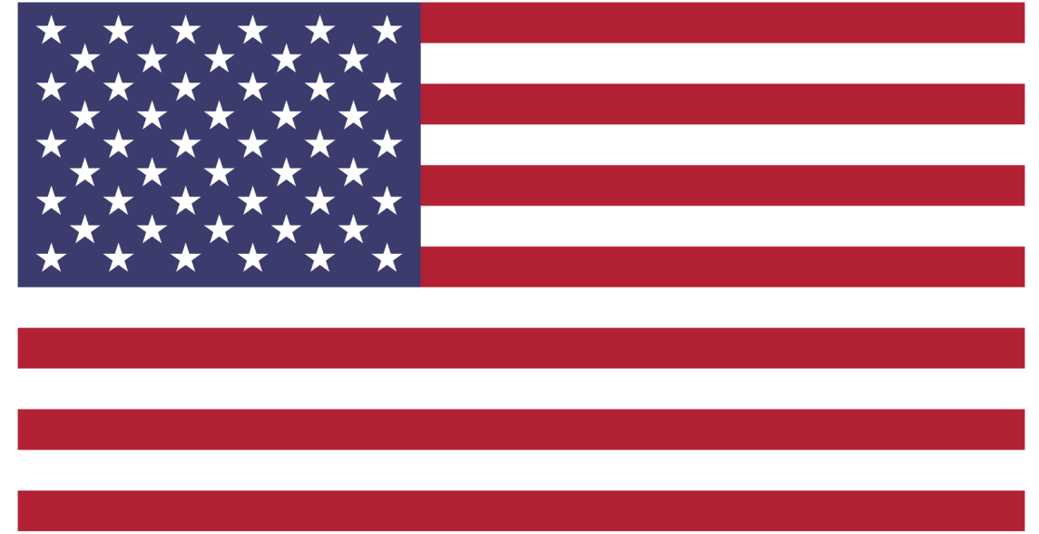
Striped red, white, and blue flag of USA.