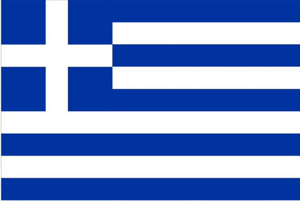
Striped white and blue flag of Greece.