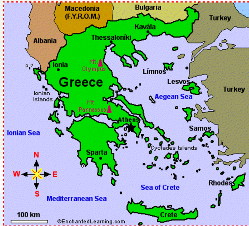
Map of Greece.