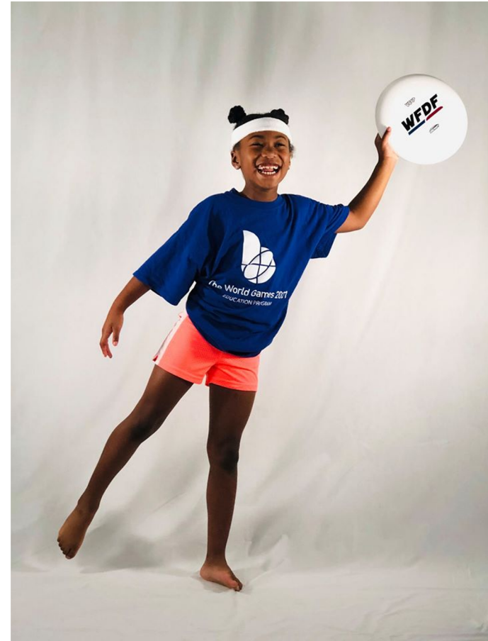
Girl in a blue shirt smiling while holding a disc.