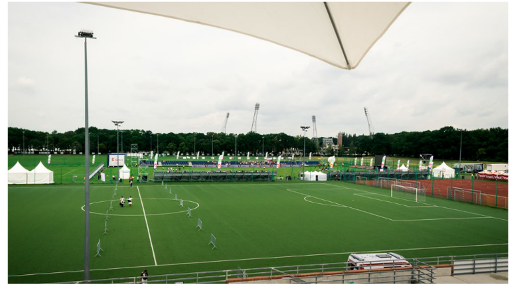
Green grass flying disc field with goal.